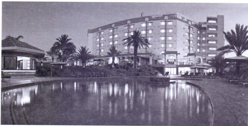
Safari Hotels, Namibia - Africa