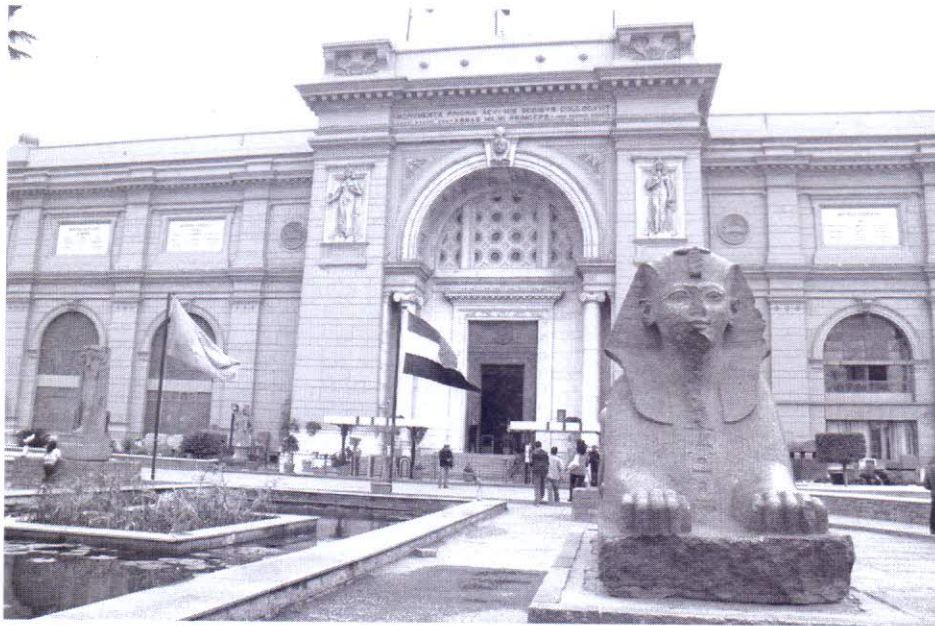
Egyptian Museum in Central Cairo, Egypt