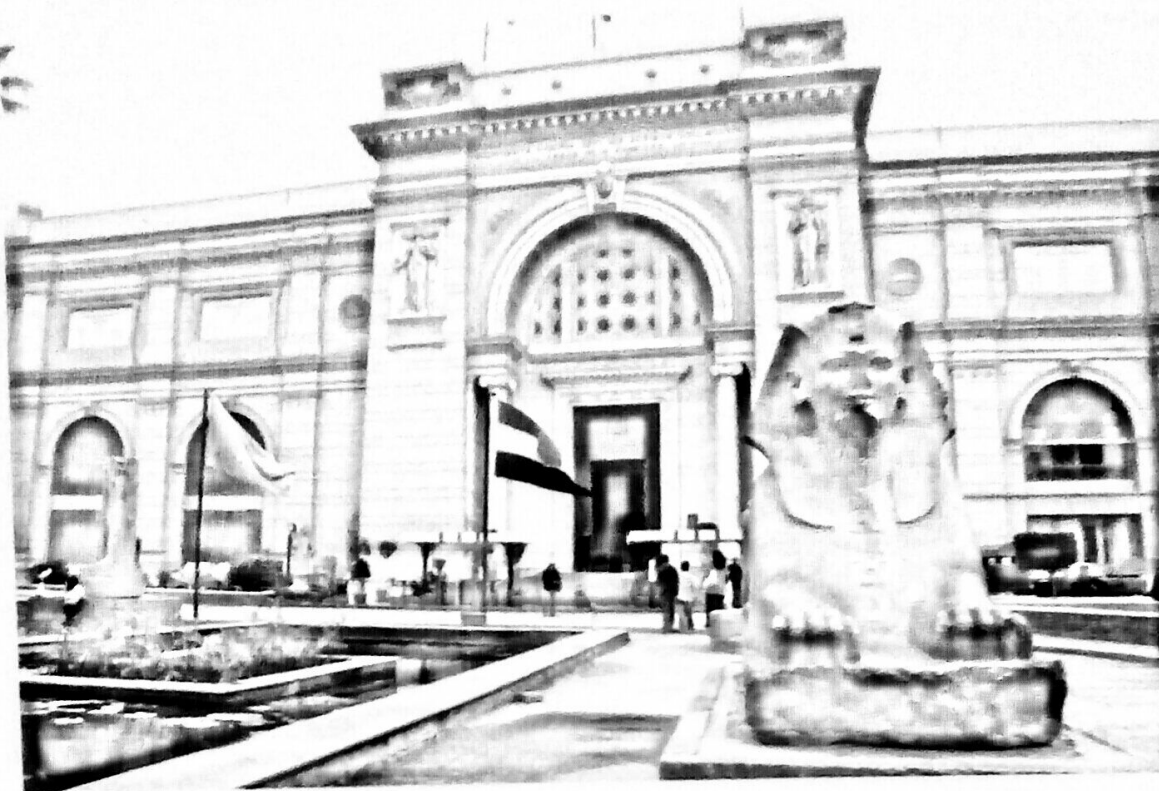
Egyptian Museum in Central Cairo, Egypt