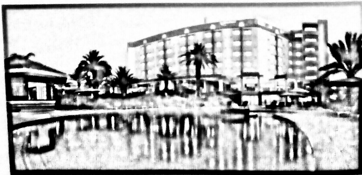
Safari Hotels, Namibia - Africa