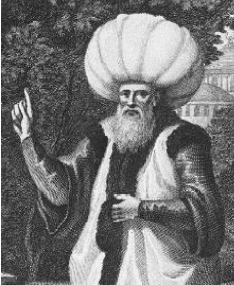
Caliph Harun al-Rashid